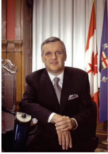
The Honourable David C. Onley, O. Ont., The Lieutenant Governor of Ontario